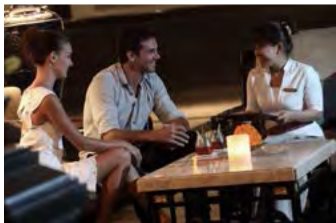
Wi-Fi allows the staff to engage guests anywhere in the hotel

The InterContinental Bali Resort began using Ubiquiti products in 2007 and has remained a loyal Ubiquiti customer for the last seven years, using UniFi APs and outdoor units to enable Internet coverage for the entire 18-hectare (44.5-acre) resort.