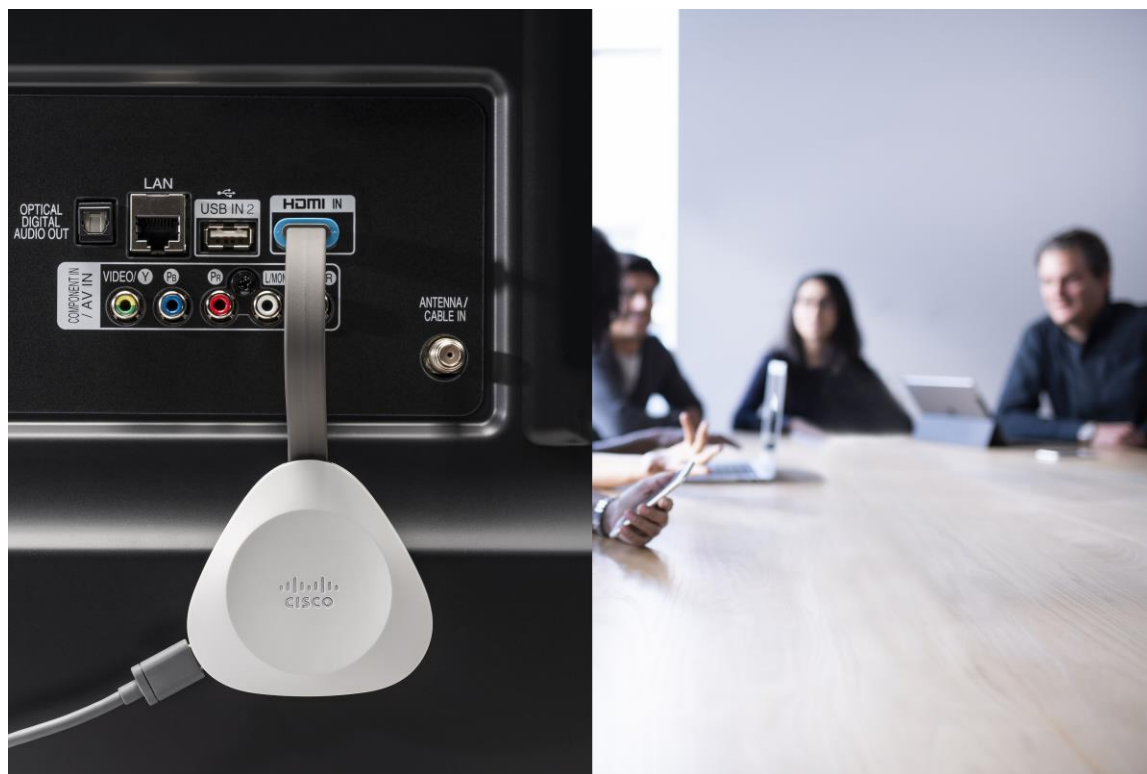
Figure 3. Webex Share installation

Cisco Webex Share is installed behind the screen (Figure 4). The package includes a cable management sticker that allows users to correctly position the device behind the display and to avoid mechanical stress on the HDMI port. The HDMI cable has been designed to sustain the device weight.