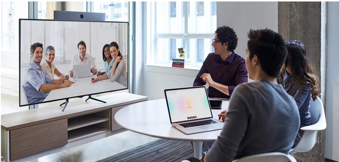
Figure 1. Cisco Webex Room Kit in small room scenario

The Room Kit – which includes camera, codec, speakers, and microphones integrated in a single device – is ideal for rooms that seat up to seven people. It offers sophisticated camera technologies that bring speaker-tracking capabilities to smaller rooms. The product is rich in functionality and experience but is priced and designed to be easily scalable to all of your small conference rooms and spaces – whether registered on the premises or to Cisco Webex.