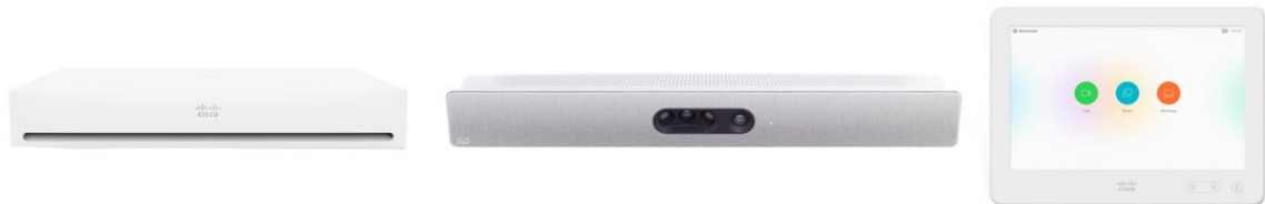
Figure 2. Cisco Webex Room Kit Pro integrator package with Quad Camera and Touch 10