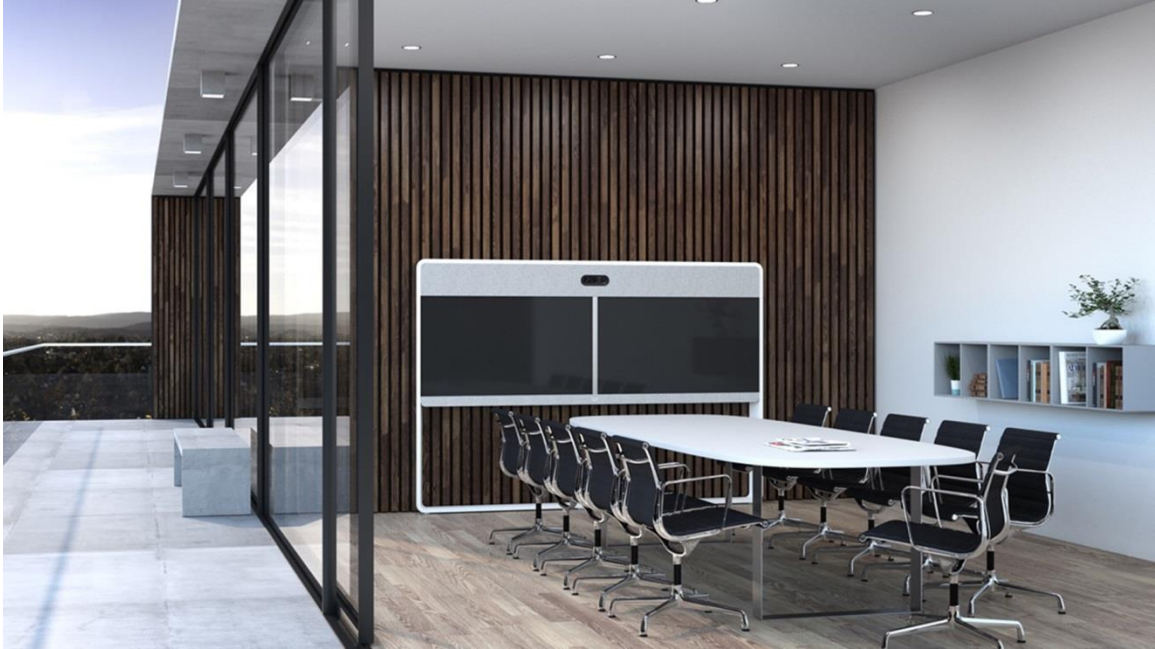
Figure 2. Cisco Webex Room 55 Dual in a large conference room