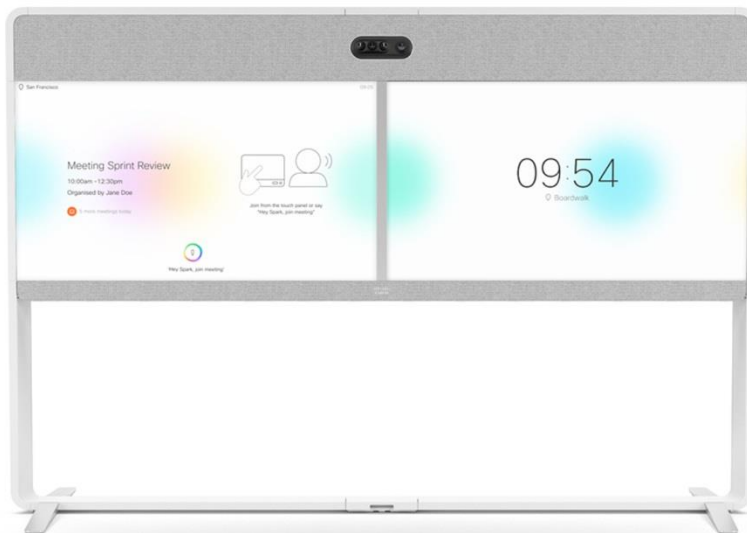
Figure 1. Cisco Webex Room 55 Dual on free-standing floor stand

* Integrated microphones for speaker tracking only.